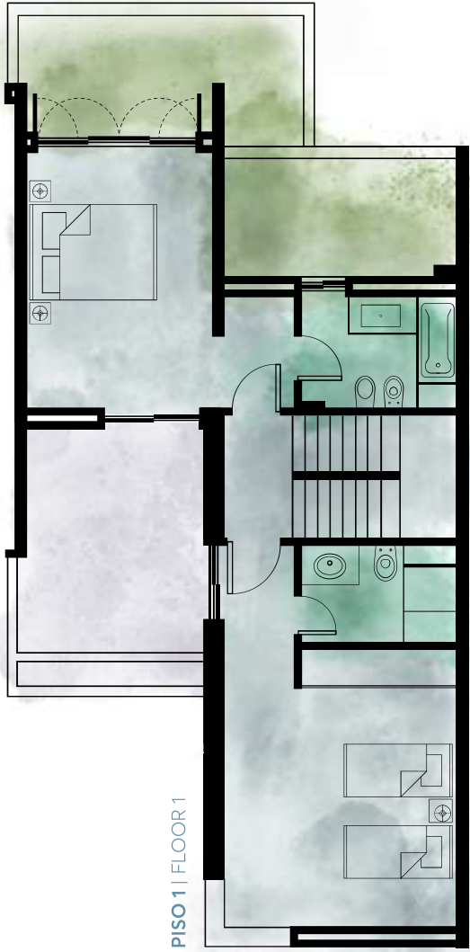
PISO 1 | FLOOR 1