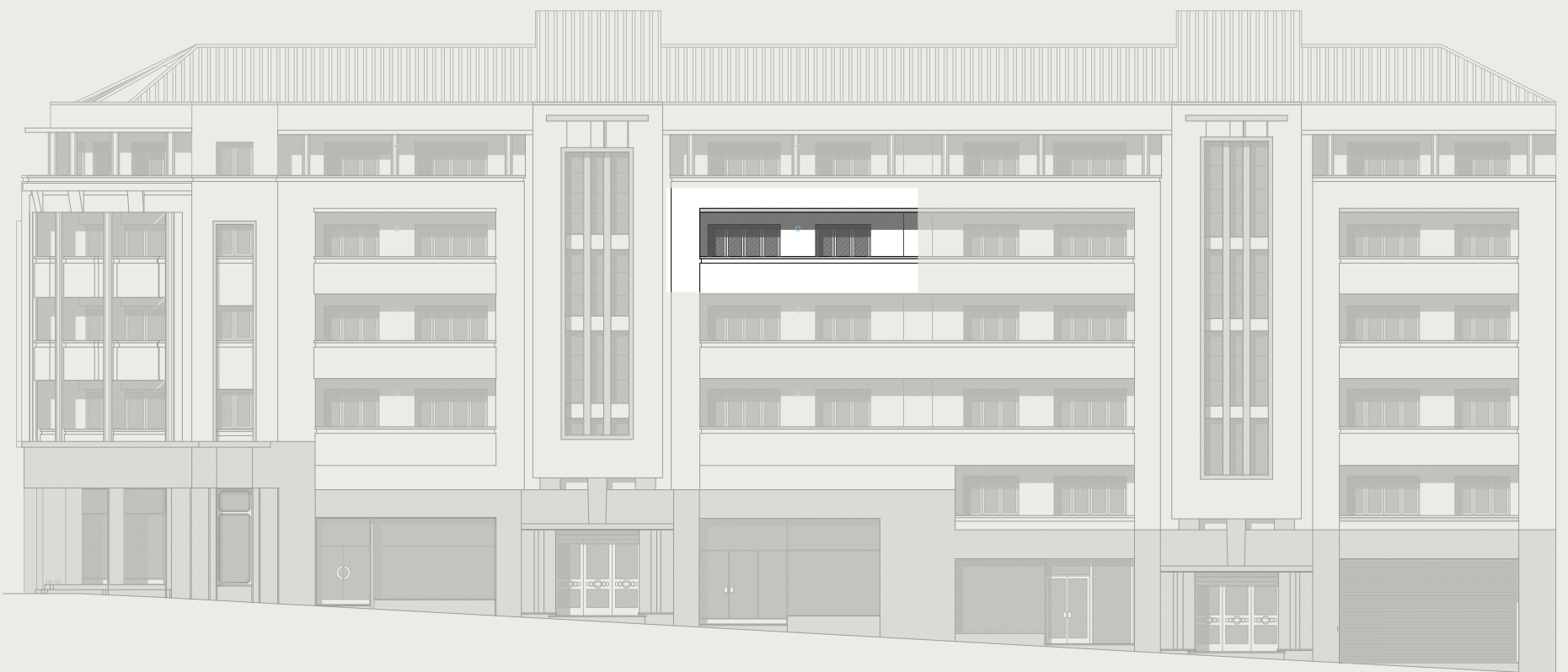
ALÇADO / FACADE RUA SÁ DA BANDEIRA

SUL - NASCENTE - POENTE - NORTE ÁREA BRUTA PRIVATIVA 146.4m² TERRAÇOS OU VARANDAS SOBRE O JARDIM 3.7 m² VARANDAS SOBRE A RUA 6.8 m² ARRUMOS NA GARAGEM 5.8 m² LUGARES DE ESTACIONAMENTO 2