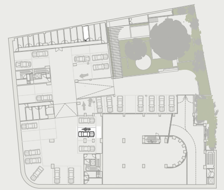
ARRUMO & LUGAR DE GARAGEM STORAGE & PARKING SPACE