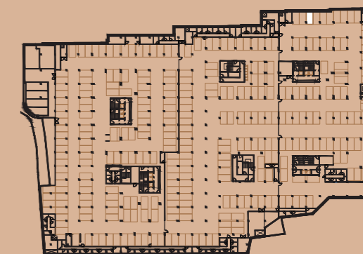
PLANTA PISO ESTACIONAMENTO -2 / PARKING FLOOR -2