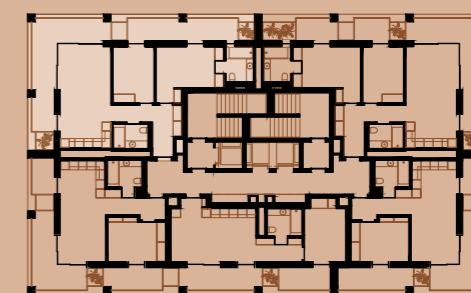
PLANTA PISO 13 | FLOOR PLAN 13

LUGARES DE ESTACIONAMENTO + ARRECADAÇÃO | PARKING UNITS + STORAGE 2+1