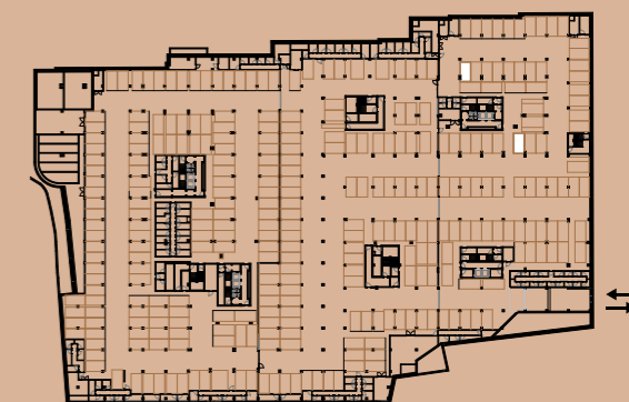
PLANTA PISO ESTACIONAMENTO -2 / PARKING FLOOR -2