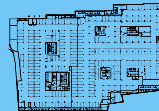
PLANTA PISO ESTACIONAMENTO -1 / PARKING FLOOR -1