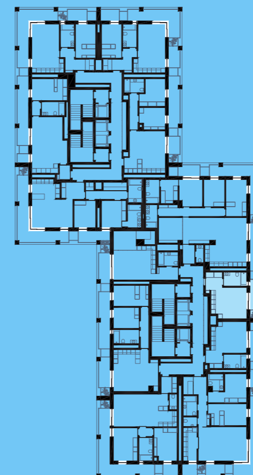
PLANTA PISO 11 | FLOOR PLAN 11

LUGARES DE ESTACIONAMENTO | PARKING UNITS 1