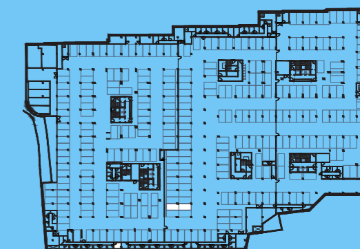
PLANTA PISO ESTACIONAMENTO -2 / PARKING FLOOR -2