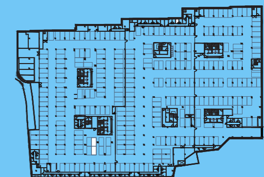
PLANTA PISO ESTACIONAMENTO -2 / PARKING FLOOR -2