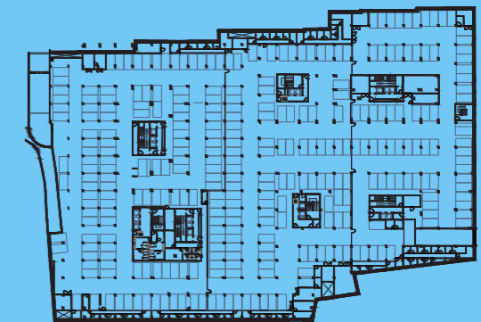
PLANTA PISO ESTACIONAMENTO -1 / PARKING FLOOR -1