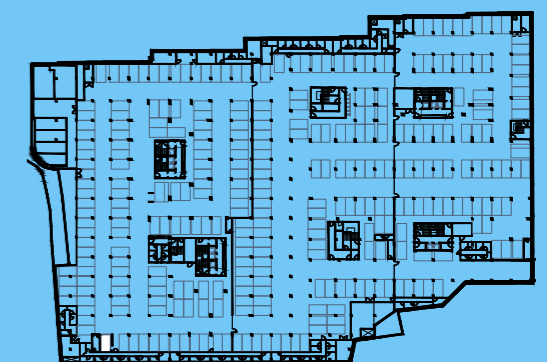
PLANTA PISO ESTACIONAMENTO -2 / PARKING FLOOR -2