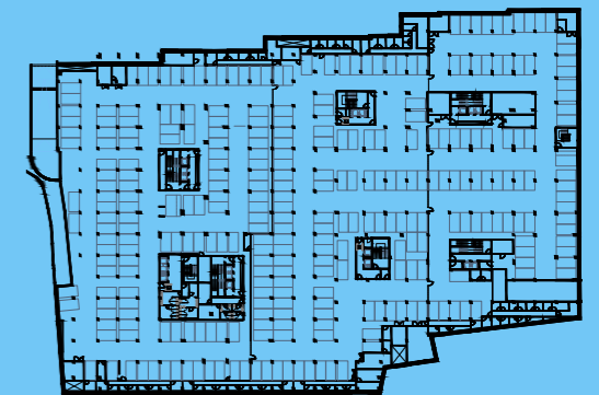
PLANTA PISO ESTACIONAMENTO -1 / PARKING FLOOR -1