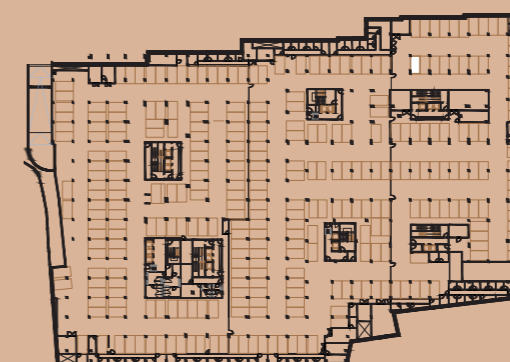
PLANTA PISO ESTACIONAMENTO -1 / PARKING FLOOR -1