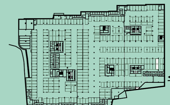
PLANTA PISO ESTACIONAMENTO -2 / PARKING FLOOR -2