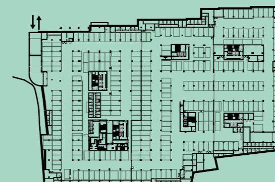
PLANTA PISO ESTACIONAMENTO -1 / PARKING FLOOR -1