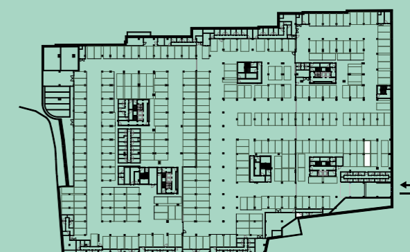
PLANTA PISO ESTACIONAMENTO -2 / PARKING FLOOR -2