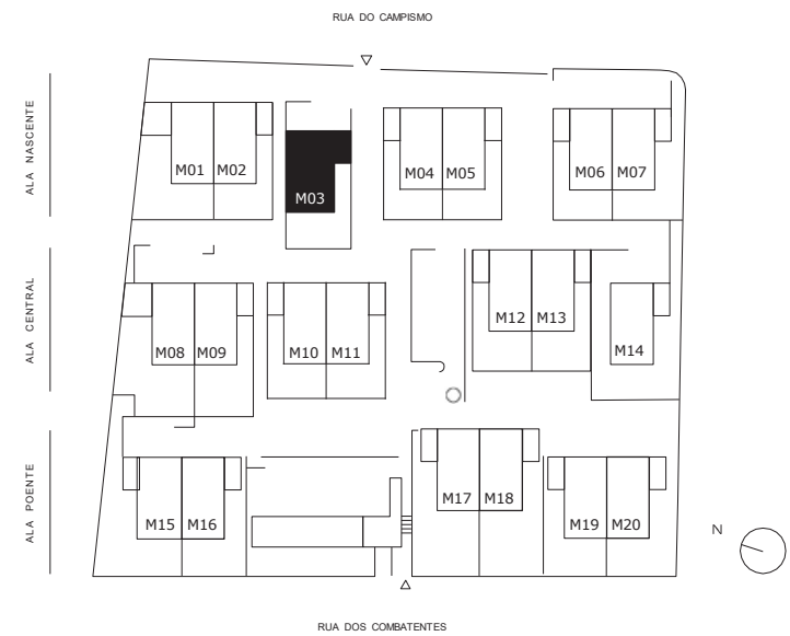
Planta geral General plan