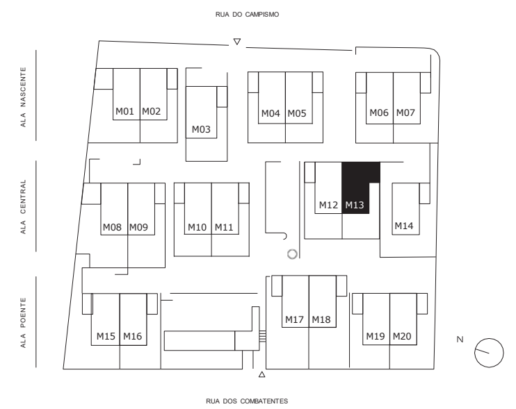
Planta geral General plan