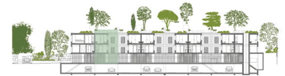
Alçado Norte - Corte Longitudinal