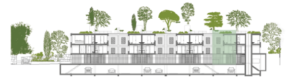
Alçado Norte - Corte Longitudinal