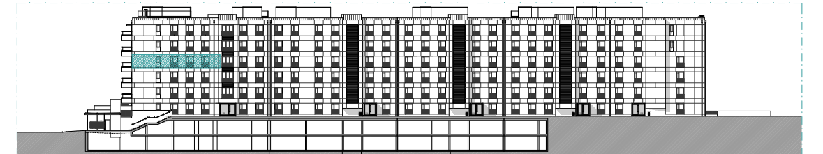
ALÇADO TARDOZ / ELEVATION ARRIÈRE / REAR ELEVATION