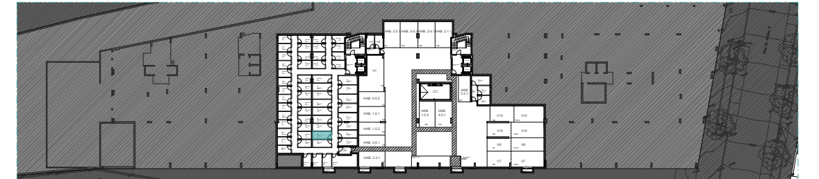
PISO -1 | ÉTAGE -1 | FLOOR -1