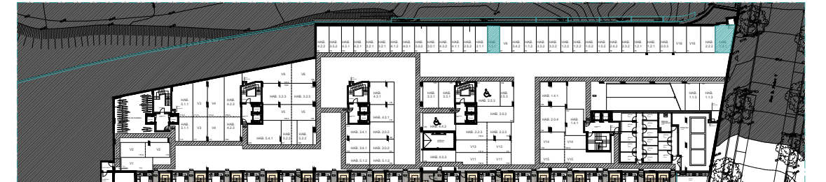
PISO 0 | ÉTAGE 0 | FLOOR 0