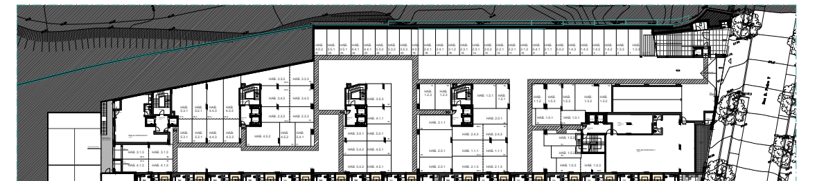
1º PISO | ÉTAGE 1 | 1ST FLOOR