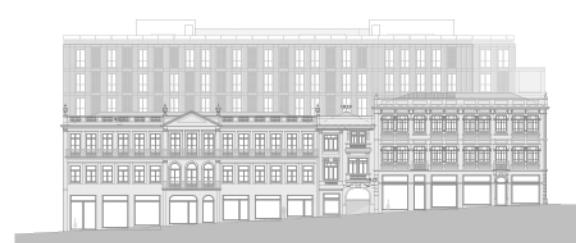
Alçado - Rua Sá da Bandeira