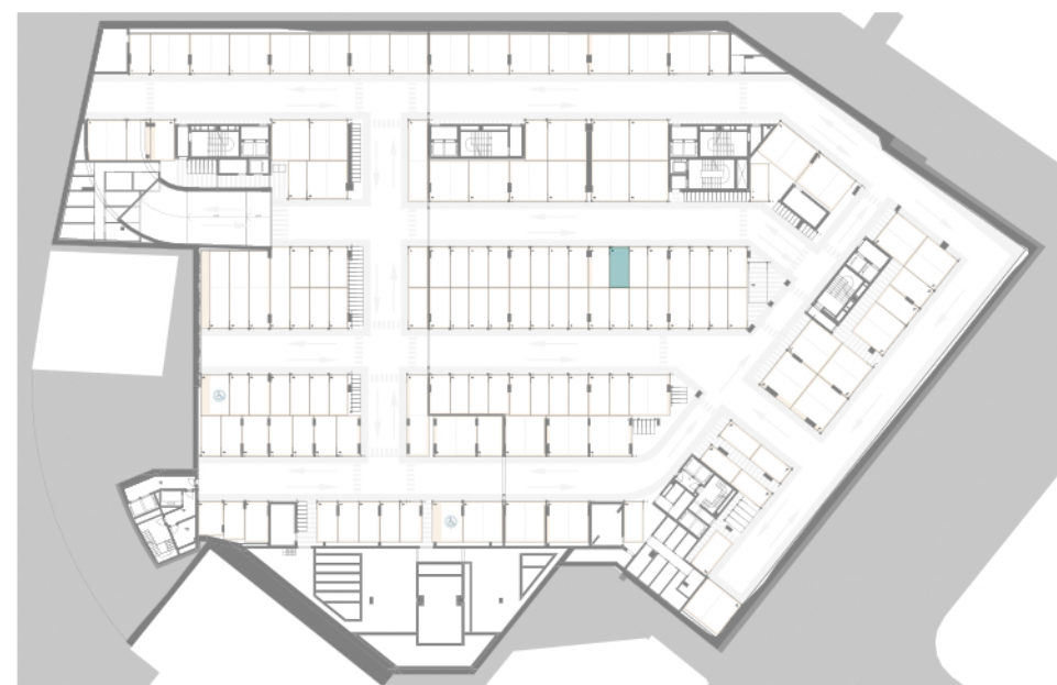
Piso -3 | Étage -3 | Floor -3 Estacionamento / Parking / Parking