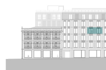
Alçado - Rua Formosa