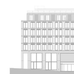
Alçado - Rua do Bonjardim