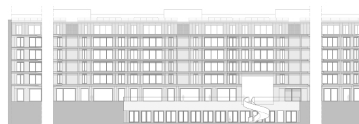
Alçado Sudoeste - Praça Interior