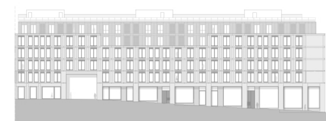
Alçado - Travessa do Bonjardim