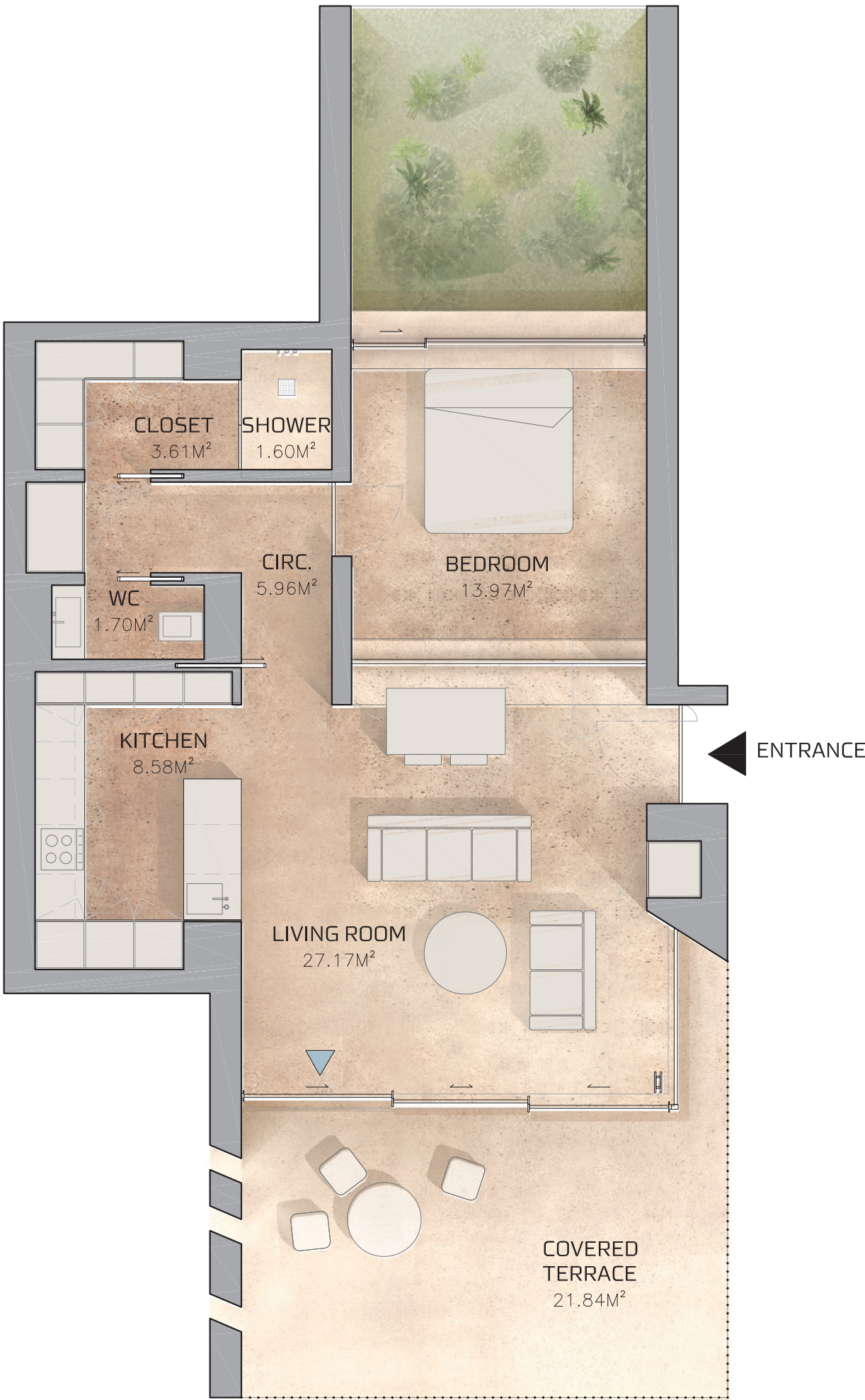
Entrance Floor Plan

Signature apartments by RCR ARQUITECTES PHASE II (PLOT 118) KRONOSHOMES