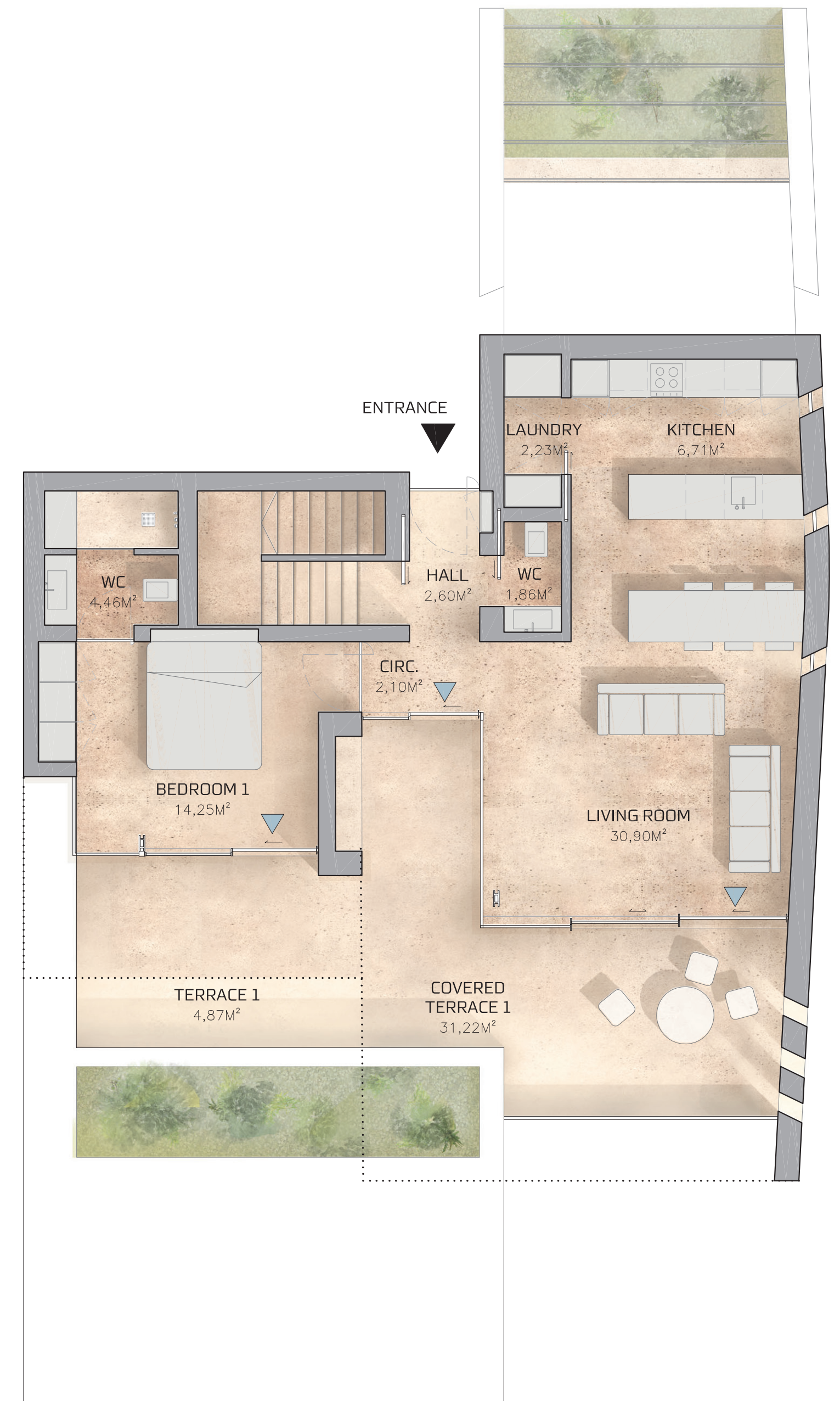
Entrance Floor Plan